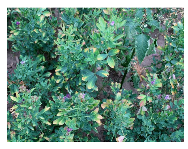
Potato leafhopper damage in a new alfalfa seeding.

A pest we are more familiar with, potato leafhopper, has also been problematic in some fields. Upper Peninsula alfalfa growers are generally familiar with this pest, which sucks juice from alfalfa leaves and injects a toxic saliva into the plant.