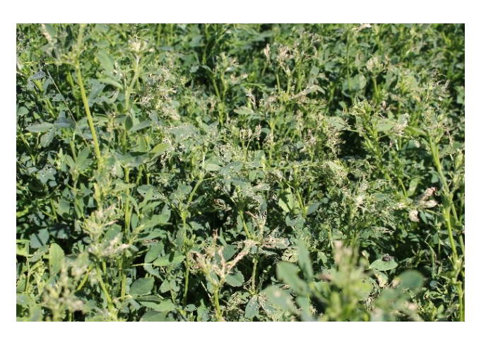
Alfalfa weevil damage, 6/16/21, Chatham, MI

If alfalfa weevil has impacted your alfalfa this year, keep an eye on the regrowth for small, green larvae eating foliage. It is unlikely that a second generation will give us much trouble, but with the unusual weather this year, you never know.