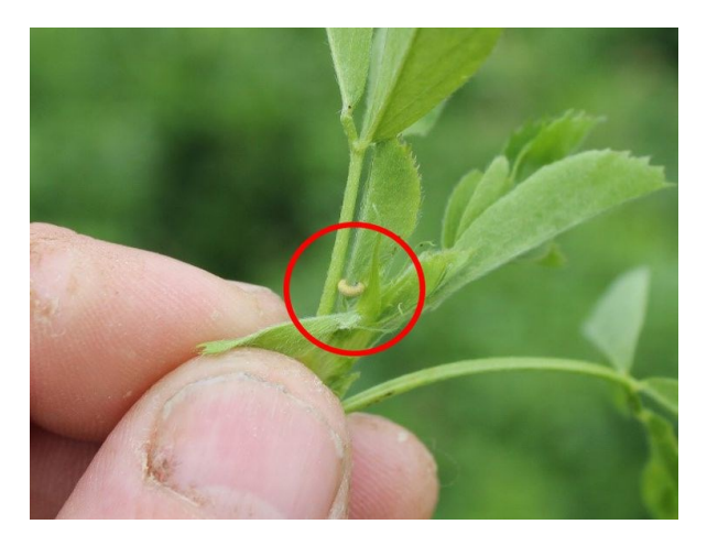
Alfalfa weevil larva

According to MSU field crops entomologist, Dr. Chris Difonzo, 'the easiest scouting method uses tip injury. Survey across the field and not just on one side or on an edge. Check tips of 100 stems for feeding. Treat if 40 percent of stems show damage and the field won't be cut for at least seven days...If a field is over threshold, cutting is the preferred control method because it preserves natural enemies and pollinators, and saves the cost of application. Also, most insecticides cannot be used within seven to 21 days of cutting, depending on the product.'